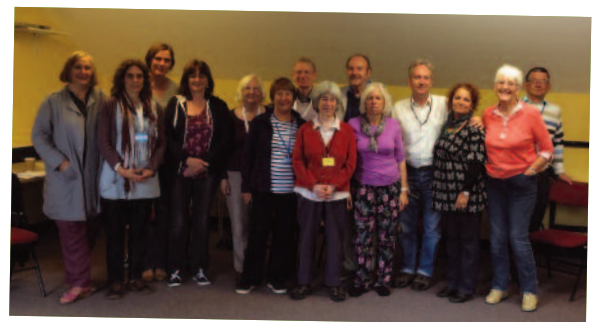
Islam and The Bahá'í Faith Course group photo

"Just being in a Baha'i environment - devotionals were great."