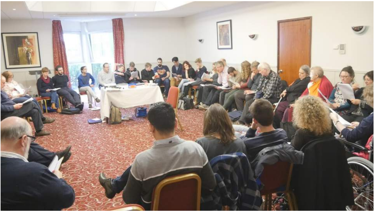
Some of the Bahá'ís at the Northern Gathering on the 9th/10th April.

A video of the "London Institutional Gathering" held in January was played and covered the developments of the Faith from 1996 - 2021 and took us through the happenings, changes and accomplishments of various Plans and through to the New Five Year Plan including the Education of larger and larger numbers of people in the Institute Process with the capacity to build for the children and the empowerment of Junior Youth.