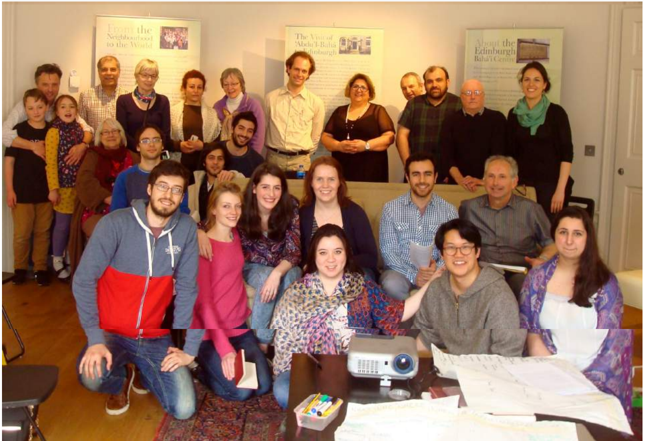
Some of Bahá'ís from the Southern Clusters at the Edinburgh (2nd/3rd April)

Nearly 40 Bahá'ís from 6 of the Clusters in the South of Scotland and the Faroe Isles gathered at the Bahá'í Centre in Edinburgh and over 60 Bahá'ís from the remaining Clusters in the North of Scotland gathered in Aberdeen to read and study the letter of the Universal House of Justice of the 29th December 2015, and to make initial plans for the New Five Year Plan .