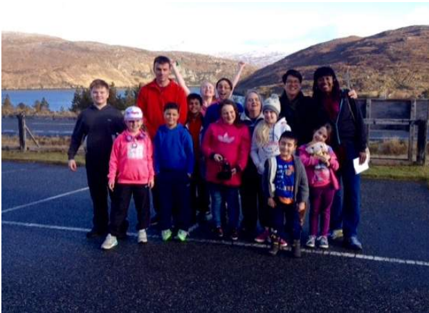
Scaladale, North Harris over 2 days during the February holidays. Children and Junior Youth attended workshops, and 4 people progressed with their study of 'Arising to serve'.

16 young people and supporting adults gathered at