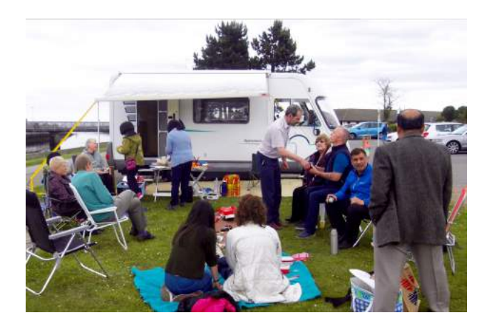
(The Picnic begins)

expression of the idea of engagement in meaningful conversation.