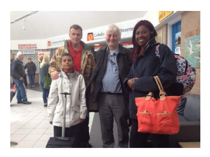
moved to pastures new. Our best wishes go with them—for now and the future.