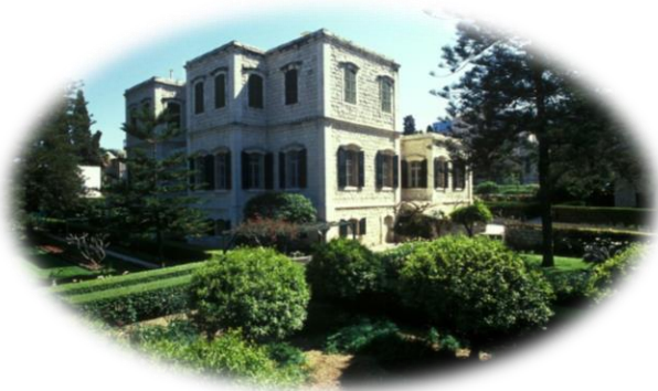
House of 'Abdu'l-Bahá

Aged 77, 'Abdu'l-Bahá passed away peacefully at His home in Haifa on 6 Qawl [10] in the Bahá'í year 81 which was the Gregorian year 1921. The next day a funeral was held the like of which Haifa had never seen, as thousands of mourners of many ethnic and religious backgrounds gathered and nine speakers paid tribute to His life of service.