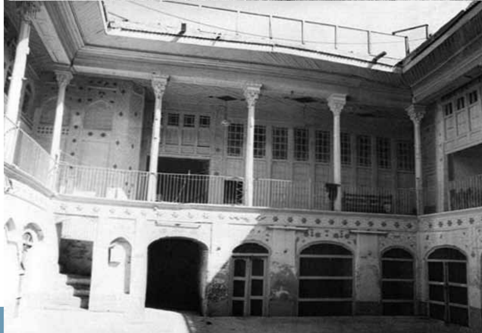
Right | Bahá'u'lláh's house in Baghdad