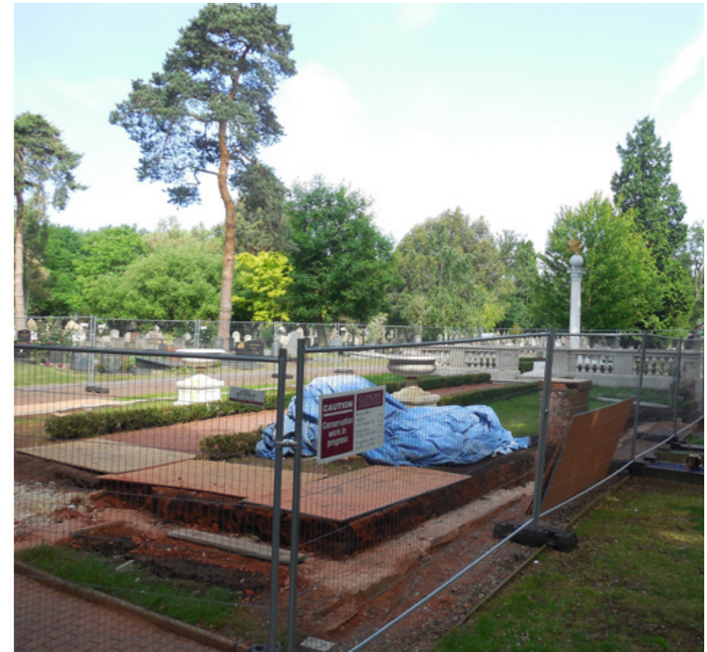
Above | Early stages of the restoration and renovation work in progress at the Resting Place of Shoghi Effendi.

The business of the policy holder (the NSA) is listed as the Promotion of the Bahá'í Faith in the United Kingdom. Normal Bahá'í activities are listed, including 19 Day Feasts,