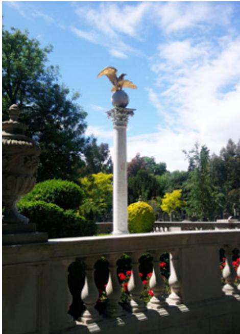
Below | Resting Place of Shoghi Effendi, London