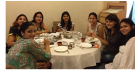
Above | Mothers in Mumbai

We moved to Mumbai, India some months ago, and like all moves involving a new culture, it has been an exhilarating process with a great deal of learning. Mumbai, perhaps more so than most modern cosmopolitan cities, suffers from extremes of wealth and poverty. The world's most expensive home - Antilla - a 27 story high-rise built for a family of four and which cost $1.8 billion to construct sits alongside South East Asia's largest Slum - Dharavi - where 1 million people live in 1 square mile. Strikingly in this city of contrasts there appears to be a general sense of indifference and apathy towards the many obvious injustices people face in their daily lives.