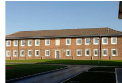
Above | Bure Prison, Norwich

"Is it ever possible' they ask 'for copper to be transmuted into gold?' Say, Yes, by My Lord, it is possible." (Gleanings XCVII)