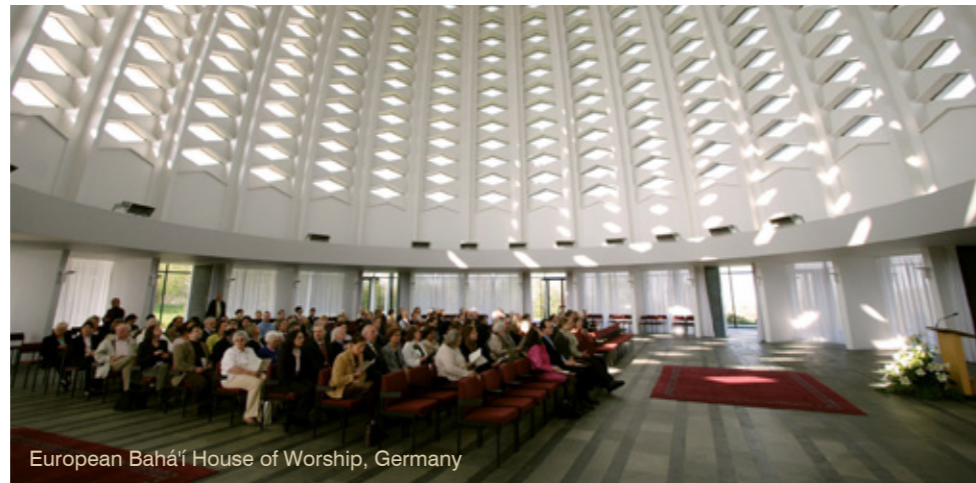
European Bahá'í House of Worship, Germany

The Sunday devotionals take place at 3pm in the National Hazíratu'l-Quds and the Visitors and Information Centre and Book Store are open as usual.