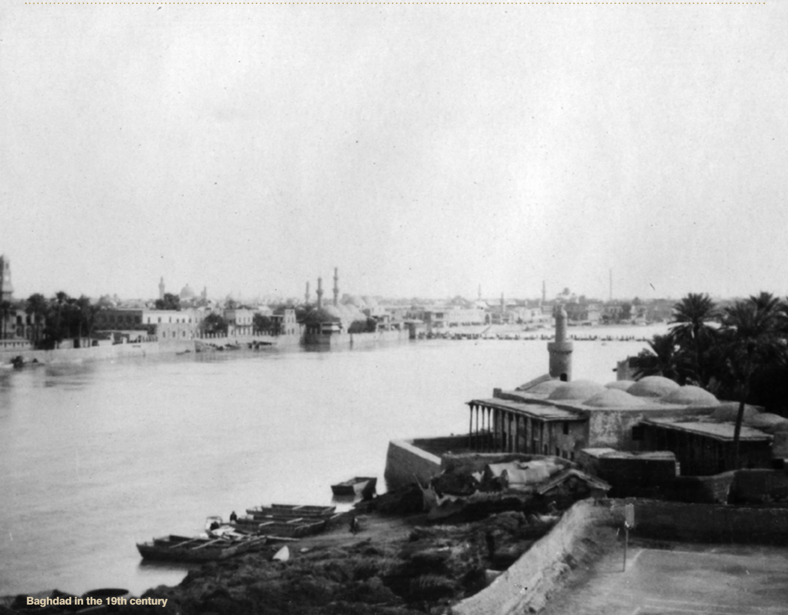
Baghdad in the 19th century