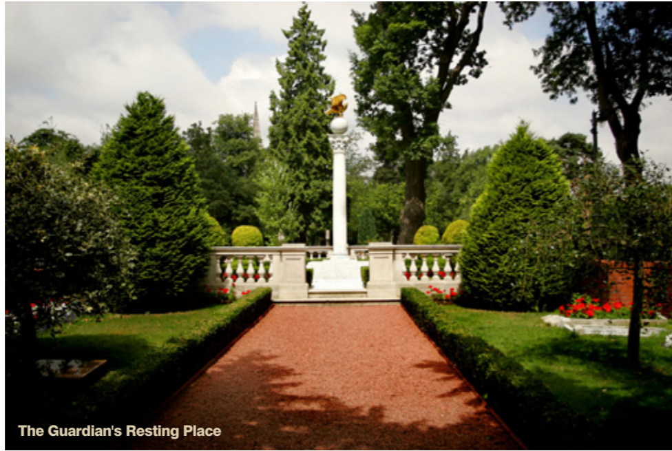
The Guardian's Resting Place