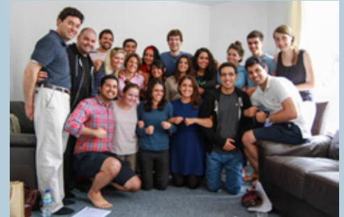
Front Cover Photo | Facilitators for the Youth Conference preparing for their joyous tasks.

In other clusters, enrolments during the expansion phase may not be high, especially in the first few cycles, and the goal is to augment the number of those willing to participate in core activities. This, then, defines the nature of the consolidation phase, which largely involves nurturing the interest of seekers and accompanying them in their spiritual search until they are confirmed in their faith. To the extent that these measures are vigorously followed, this phase can generate a considerable number of enrolments. It should be noted, however, that as learning advances and experience is gained, the ability not only to teach responsive souls, but also to identify segments of the general population with heightened receptivity, develops, and the totality of new believers increases from cycle to cycle.' (The Universal House of Justice, 27 Dec 2005)