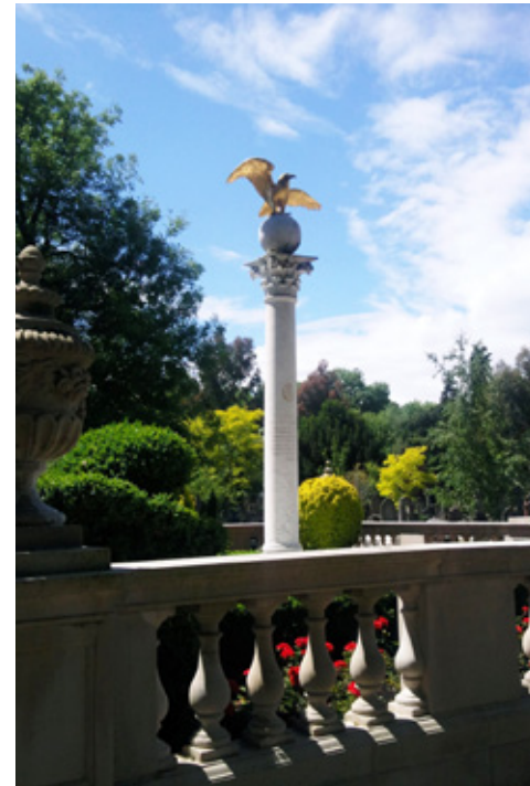
Above | Restng Place of Shoghi Effendi, London