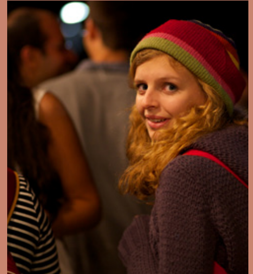
Front Cover Photo | Participant at the Youth Conference

The capacity of the individual is nurtured through “a sequence of courses that seeks to build capacity for service by concentrating on the application of the spiritual insights gained through profound study of the Writings.” (Universal House of Justice, 12/27/05)