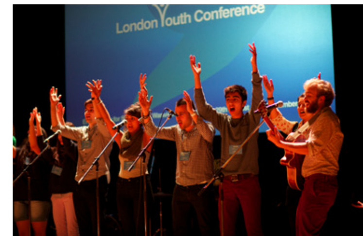
All images from London Youth Conference