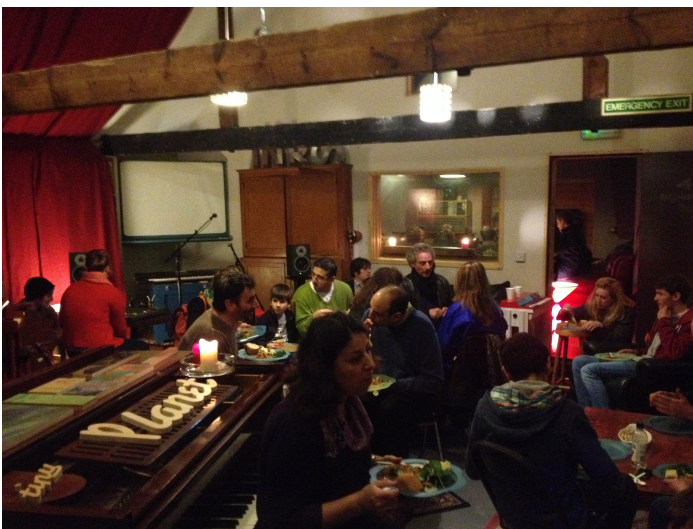
Elevated conversations during a break

Through systematic consultation, experimentation, reflection and a spirit of learning, and with amazing support from the LSA and a steady stream of both Bahá'í and other local artists, the format of the monthly e dinner-party-house-concert-fireside-dance-party was refined and honed. Its primary goal was to attract, uplift, and widen the community of interest that would be gently and lovingly invited to core activities.