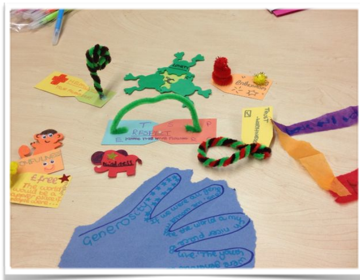
Crafts from Children's Class

The neighbourhood of Bermondsey was identified by the youth's small group facilitator as a receptive area to begin to have conversations with the local residents. The sustainability of activities was made a primary consideration, and with a resident Bahá'í family already in the area and the knowledge that the majority of the group would be able to serve there for at least three years, Bermondsey was considered an ideal place and thus plans for growth were put into place before the end of the youth conference.